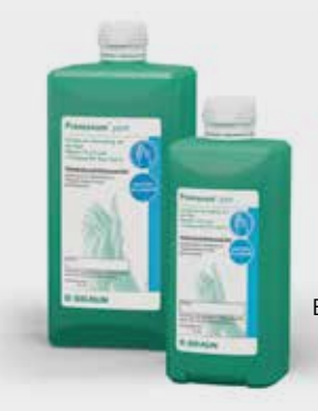
EN 12791 approved