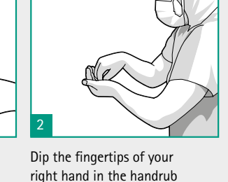
right hand in the handrub to decontaminate under the nails (5 sec).