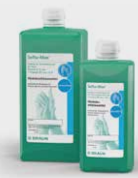
EN 12791 approved