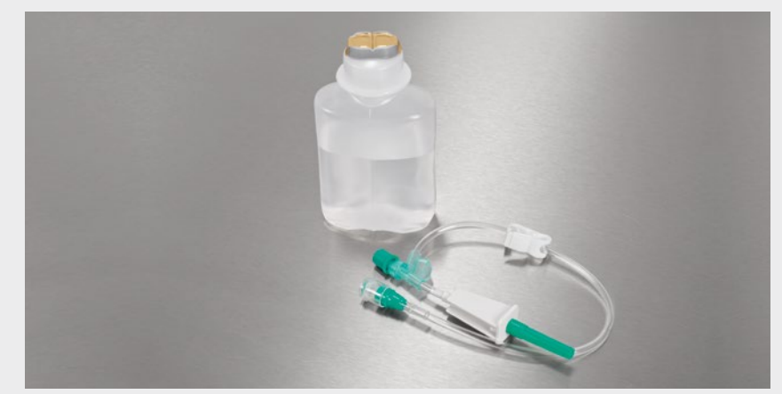
Preparation of the treatment under the Laminar air flow cabinet.