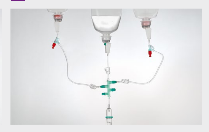
After the last drug infusion is finished, flush the IV Set again. The closed system can be disconnected from the cannula. The set is ready for disposal as a closed system.