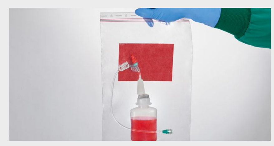
Ready for the transport to the ward.