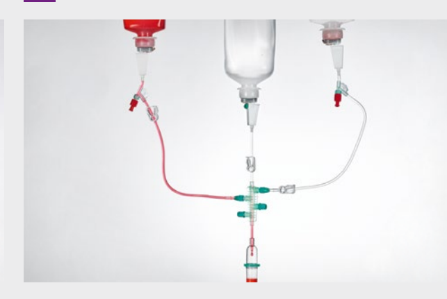
Flush the IV Set every time you change a drug infusion.