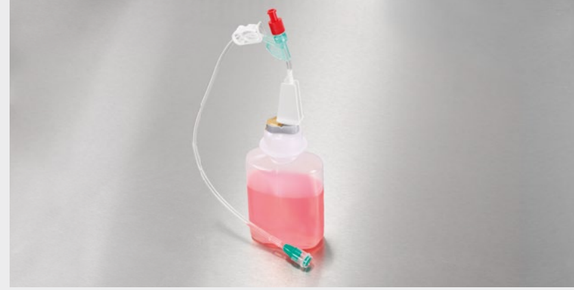
For showing the valve was in use sign it with a red combi stopper. The clamp stays closed.